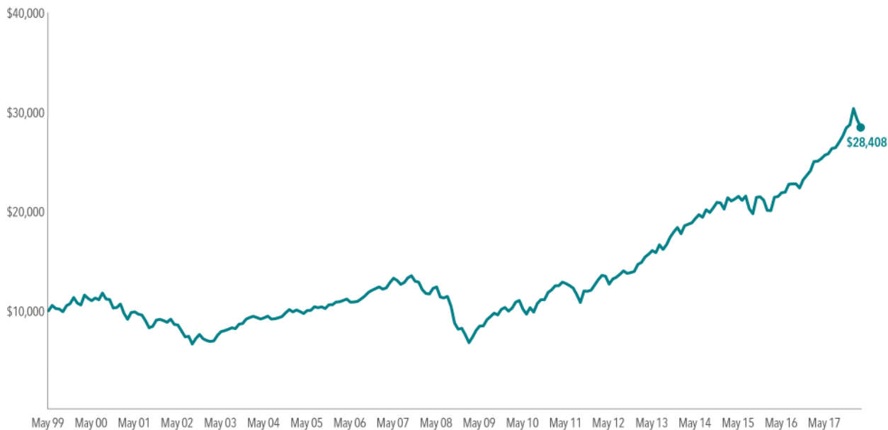
Exhibit 1. Hypothetical Growth of Wealth in the S&P 500 Index, May 1999–March 2018

© 2018 S&P Dow Jones Indices LLC, a division of S&P Global. All rights reserved. Not representative of an actual investment. Indices are not available for direct investment; therefore, their performance does not reflect the expenses associated with the management of an actual portfolio.