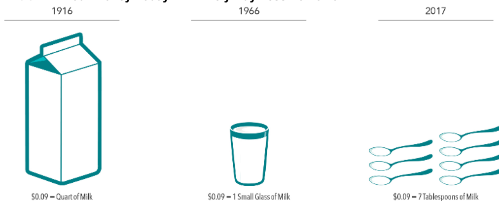
Exhibit 1. Your Money Today Will Likely Buy Less Tomorrow

This erosion of the real purchasing power of wealth is called inflation. Inflation is an important element of investing. In many cases, the reason for saving today is to support future spending. Therefore, keeping pace with inflation is a crucial goal for many investors. To help understand inflation's impact on purchasing power, consider the following illustration of the effects of inflation over time. In 1916, nine cents would buy a quart of milk. Fifty years later, nine cents would only buy a small glass of milk. And more than 100 years later, nine cents would only buy about seven tablespoons of milk. How can investors potentially prevent this loss of purchasing power from inflation over time?