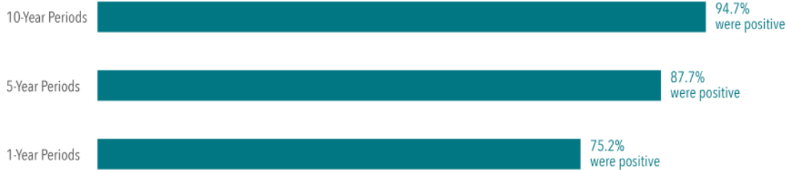
Exhibit 2. Frequency of Positive Returns in the S&P 500 Index Overlapping Periods: 1926–2018

In US dollars. From January 1926–December 2018, there are 997 overlapping 10-year periods, 1,057 overlapping 5-year periods, and 1,105 overlapping 1-year periods. The first period starts in January 1926, the second period starts in February 1926, the third in March 1926, and so on. S&P data © S&P Dow Jones Indices LLC, a division of S&P Global. Indices are not available for direct investment. Index returns are not representative of actual portfolios and do not reflect costs and fees associated with an actual investment. Past performance is no guarantee of future results. Actual returns may be lower.